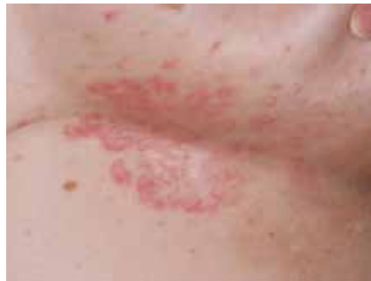
Figure 5. Submammary psoriasis. This can be difficult to differentiate from tinea and seborrhoeic dermatitis.

alopecias such as folliculitis decalvans, lichen planopilaris and dissecting cellulitis of the scalp are chronic conditions, each with a different quality of inflammation.