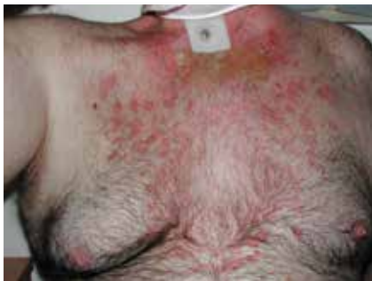
Figure 12. Seborrhoeic dermatitis.