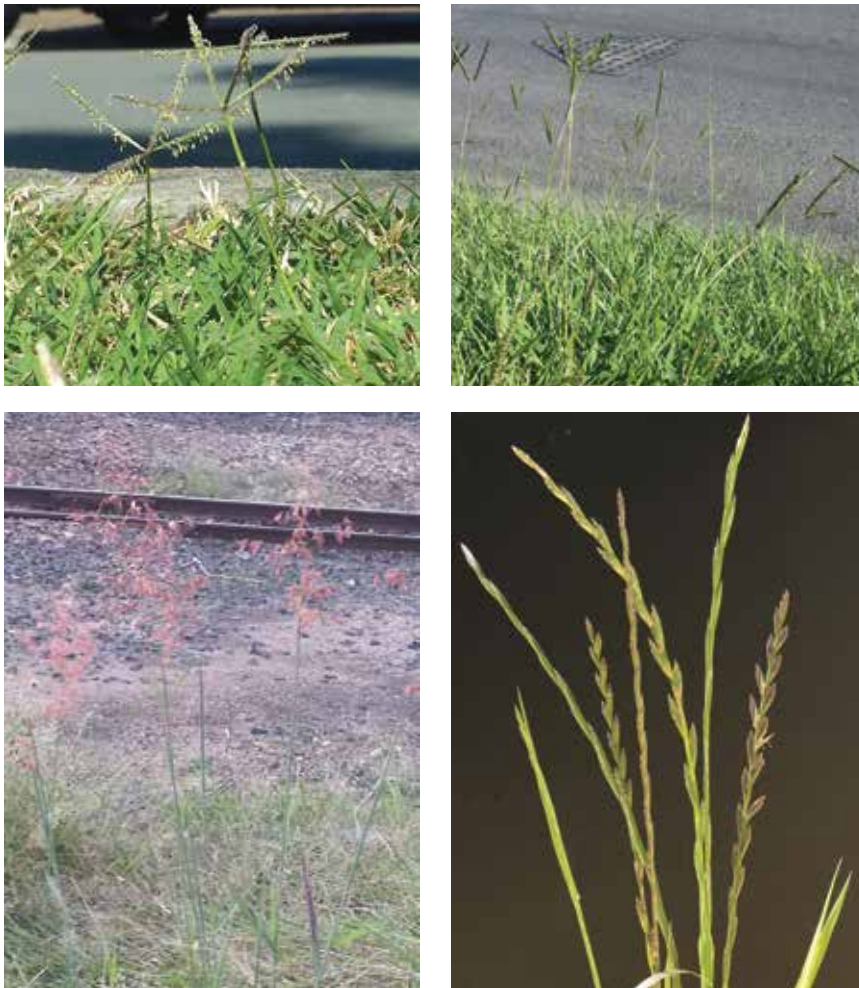
Figures 4a to 4d. Examples of common grasses in Australia that produce allergenic pollen. a (top left). Bermuda (couch) grass ( Cynodon dactylon ); b (top right). Bahia grass ( Paspalum notatum ); c (bottom left). Johnson grass ( Sorghum halepense ); and d (bottom right). Perennial ryegrass ( Lolium perenne ). Bermuda, Bahia and Johnson are subtropical grasses and ryegrass is a temperate grass.