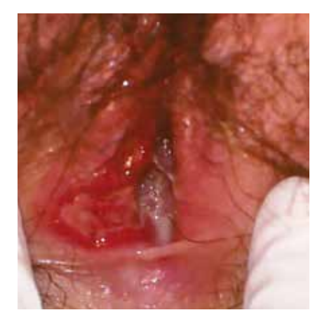
Figure 2. Nonsexually acquired genital ulceration.

A diagnosis of aphthous ulcer is made on a clinical basis; there is no specific diagnostic test available. A biopsy of an aphthous ulcer is nonspecific, revealing only loss of epithelium and a chronic mixed inflammatory infiltrate, and is therefore not indicated. It is rare that a patient will need any testing. If, however, there are any concerning symptoms for any of the conditions mentioned above then investigations for these can be undertaken. In practice, the only initial investigations likely to be necessary for a child who is otherwise well would be a swab