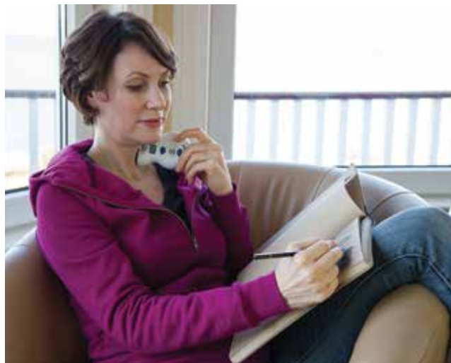
Figure 3. gammaCore® device for vagus nerve stimulation.

per week was reduced compared with patients treated with standard of care alone (-7.6 vs -2.0). The prophylactic regimen was three doses twice a day. Acute treatment was three doses at onset of pain. 8