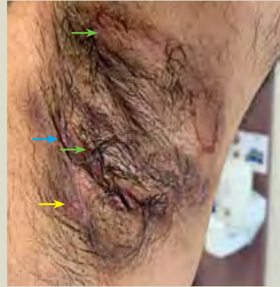
Figure 1. Axilla in a patient with hidradenitis suppurativa, showing abscesses (green arrows), a draining sinus (yellow arrow) and early hypertrophic scarring (blue arrow).