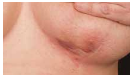
Figure 2. Inframammary lesions in a 38-year-old woman with hidradenitis suppurativa.

HS is not a homogeneous disease. 10 There is preliminary work on differentiating HS phenotypes. 24 A recent simple classification system into paediatric, female, male and genetic forms is based on age of onset, body site involvement and associated comorbidities (Table, Figure 2 and Figure 3). 25 It is