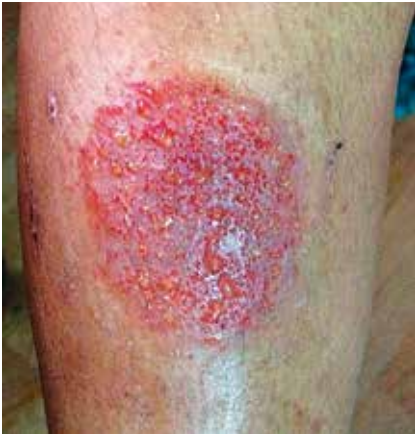
Figure 1. Exudative nummular eczema with fluid and crust formation from the lesion.

Reproduced under a Creative Commons Attribution-NonCommercial 4.0 International License from Poudel RR, et al. J Community Hosp Intern Med Perspect 2015; 5: 10.3402/jchimp.v5.27909. © 2015 Resham Raj Poudel et al.