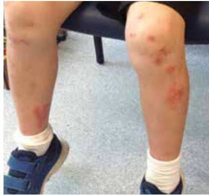
Figure 2. Dry type nummular eczema.