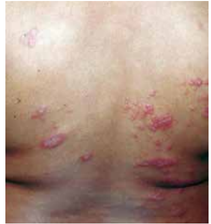
Figure 7. Pityriasis rosea.

Discoid eczema is a skin rash consisting of annular disc-shaped plaques typically affecting the trunk and lower limbs of adult male patients. It is sometimes