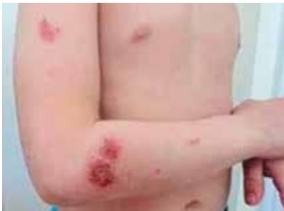
Figures 4a and b. Exudative discoid and lichenoid chronic dermatosis. Unusual occurrence in a 6-year-old boy.

Reproduced under a Creative Commons Attribution-NonCommercial 4.0 International License from Tabara K, et al. Postepy Dermatol Alergol 2013; 30; 403-408. © 2013 Termedia Sp.