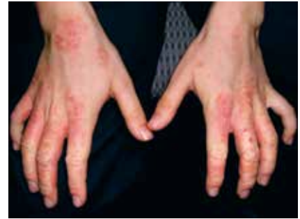
Figure 3. Discoid eczema of the hands.