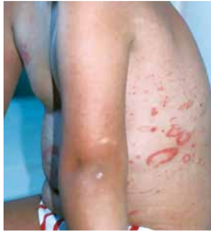
Figure 6. Psoriasis.

Patients with the exudative subtype of discoid eczema may benefit from an oral antibiotic such as cefalexin, clarithromycin or a tetracycline. Secondary bacterial infections should be treated with topical or oral antistaphylococcal antibiotics depending