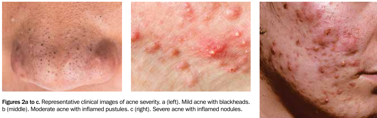
Figures 2a to c. Representative clinical images of acne severity. a (left). Mild acne with blackheads. b (middle). Moderate acne with inflamed pustules. c (right). Severe acne with inflamed nodules.

paramount to the success of treatment. There are many inexpensive skincare ranges that offer acne cleansers and moisturisers that aim to be gentle to the skin and not be occlusive. The use of an appropriate cleanser and moisturiser can also minimise the irritancy of many topical acne treatments as well as dry skin often associated with oral isotretinoin use.