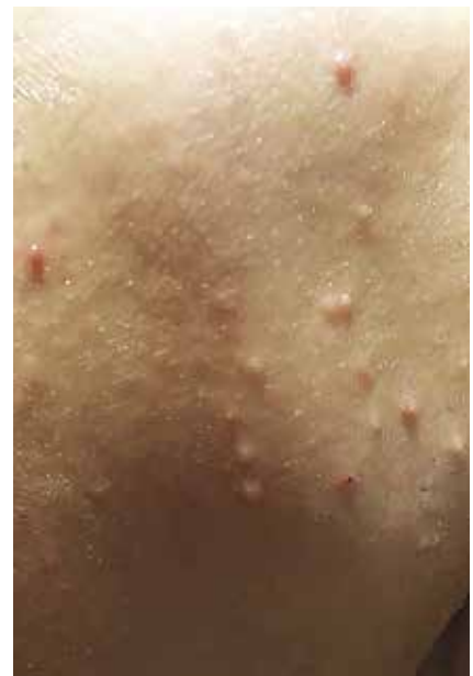
Figure 5. A vesicular eruption in a patient with COVID-19.