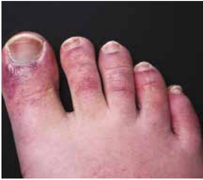
Figure 2. COVID toes showing violaceous macules.

are more common in middle-aged women and have been associated with mild or moderate disease. 4