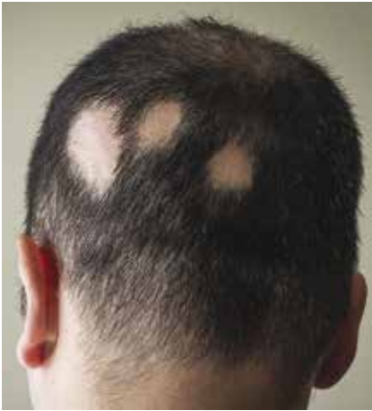
Figure 6. Alopecia areata can occur in patients after COVID-19.