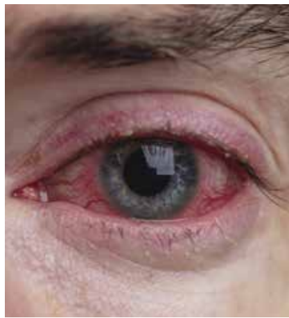
Figure 7. Conjunctivitis can be a late complication of severe COVID-19.