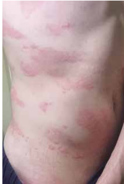
Figure 3. Urticarial eruption in a patient with COVID-19.

A vesicular eruption has been seen in patients with COVID-19, consisting of small fluid-filled blisters most often on the trunk or hands (Figure 5). It occurs early in the disease course and has