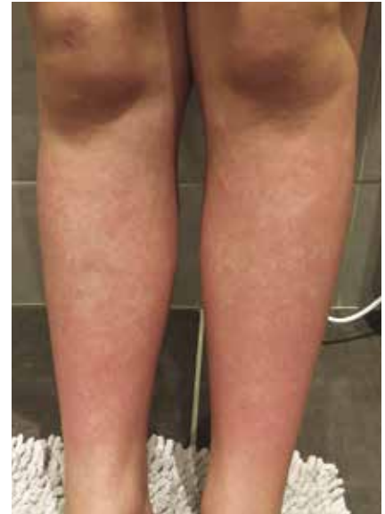
Figures 1a and b. Maculopapular eruption in patients with COVID-19. These eruptions are usually truncal but can spread to the limbs. 1a reproduced with permission from DermNet New Zealand. 1b reproduced with permission from Covidskinsigns.com, funded by Zoe Global Ltd (which funded the COVID Symptom Study App) and the British Association of Dermatologists.

In addition, COVID-19 has been associated with erythema multiforme, conjunctivitis, oral mucosal ulceration, petechiae, chronic urticaria and gangrene. 2,3 A multisystem inflammatory syndrome that includes skin changes has also been noted in children with COVID-19. 2,3