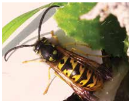
Figure 4. Vespa germanica (the ‘European wasp’ or ‘yellow jacket’) is found mainly in cooler regions. It is characterised by a waist part that becomes rapidly thicker at the abdomen and by its way of holding its legs close to the body during flight. These insects are particularly attracted to rotting meat, fallen fruit and sweet drinks (leading to oropharyngeal stings and airway obstruction).

© JACINTA LLUCH VALERO/FLICKR. Figure reproduced under a Creative Commons Licence (CC BY-SA 2.0).