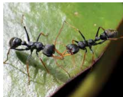
Figure 5. Myrmecia pilosula (the jack jumper ant) is a type of ‘jumper ant’ or ‘hopper ant’. About 10 to 12mm long, it moves in short jerky movements, jumping to attack, sometimes out of surrounding bushes. Serological data suggest that it is responsible for about 90% of ant venom allergy in south-eastern Australia. It has well-developed vision, is attracted to movement and is extremely aggressive.

© NATALIE TAPSON/FLICKR. Figure reproduced under a Creative Commons Licence (CC BY-SA 2.0).