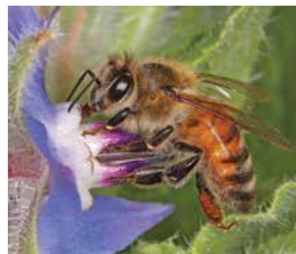
Figure 3. Apis mellifera (the honey bee). The presence of a retained stinger in the skin is diagnostic. In very hot weather honey bees seek out water and may be encountered accidentally in open drink bottles (leading to oropharyngeal stings and airway obstruction).

© JUDY GALLAGHER/Flickr. Figure reproduced under a Creative Commons Licence (CC BY-SA 2.0).