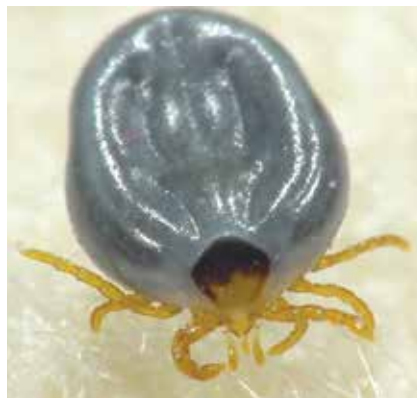
Figures 7a and b. Ixodes holocyclus . a (left). Adult female, about 3 to 3.5 mm in length. b (right). A semi-engorged nymphal paralysis tick.