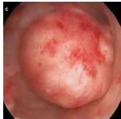
Figures a to e. Intraoperative photos. Clockwise from top left: (a) serosal fibroids, (b) endometrial polyp, (c) submucosal fibroid, (d) endometrial hyperplasia and (e) adenomyosis.

Images (a) and (e) reproduced under a Creative Commons CC0 License. Images (b) to (d) courtesy of Dr Farrell.