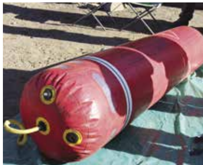
Figure. A personal hyperbaric chamber.

occurs in up to 80% of travellers who ascend over 3000m), through to AMS and finally to HACE, which is fatal if left untreated. 4