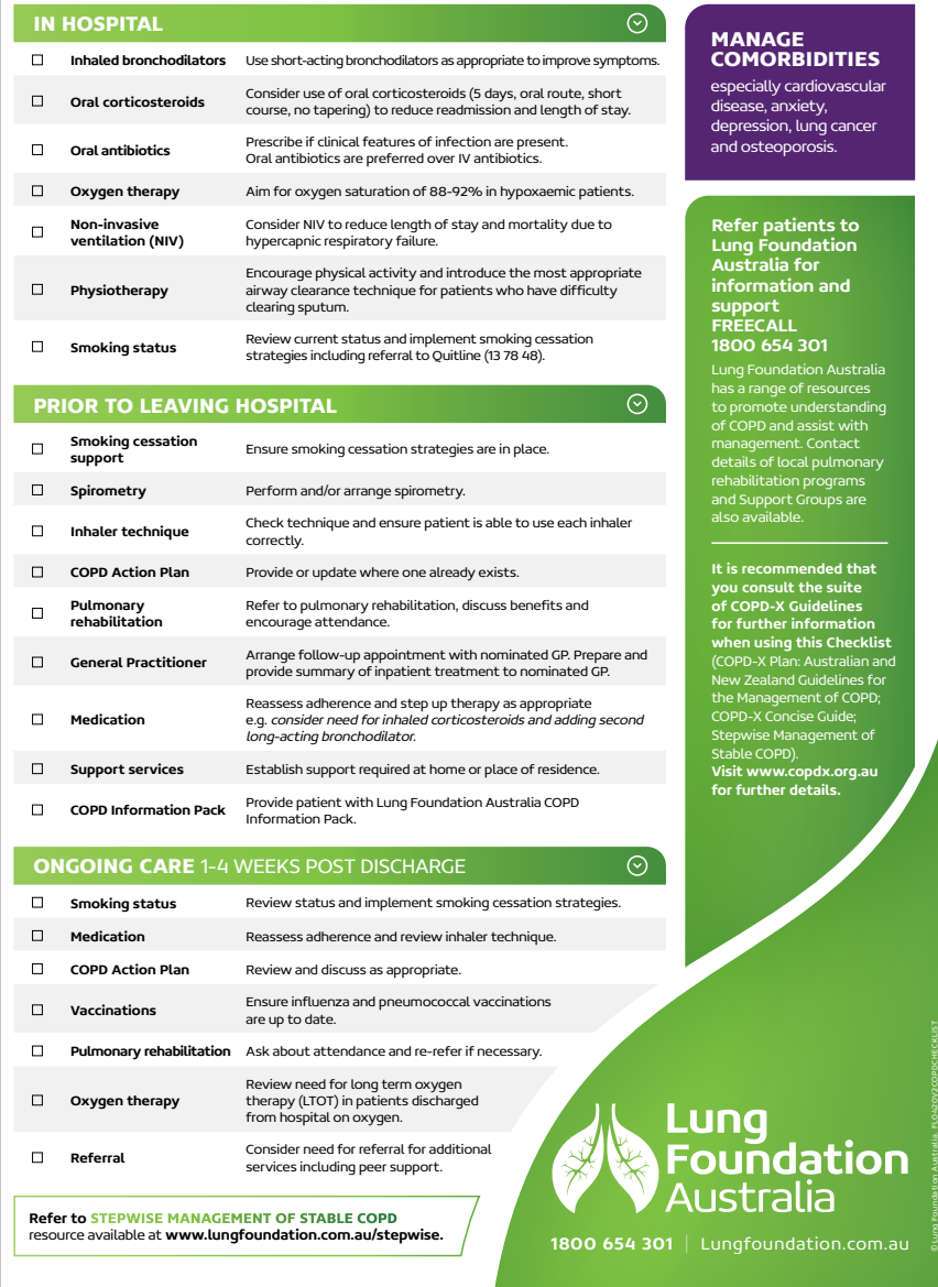
Figure 2. Checklist for managing a COPD exacerbation ( https://lungfoundation.com.au/resources/managing-copd-exacerbation-checklist/ ).

This Checklist is supported by the use of STEPWISE MANAGEMENT OF STABLE COPD available at www.lungfoundation.com.au/stepwise .