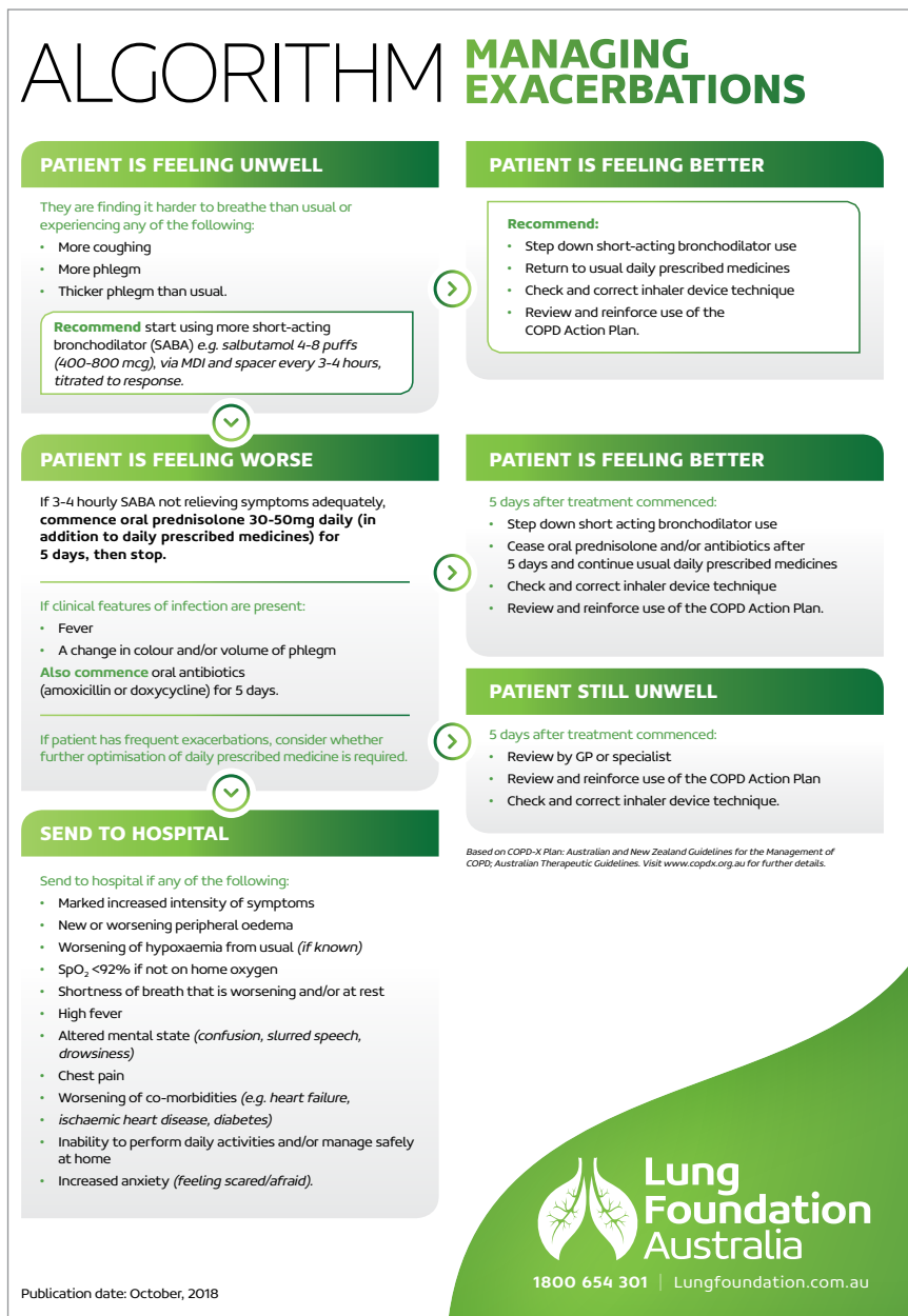
Figure 1. Algorithm for managing exacerbations in primary care ( https://lungfoundation.com.au/resources/managing-exacerbations-algorithm/ ).

© Lung Foundation Australia. Reproduced with permission.