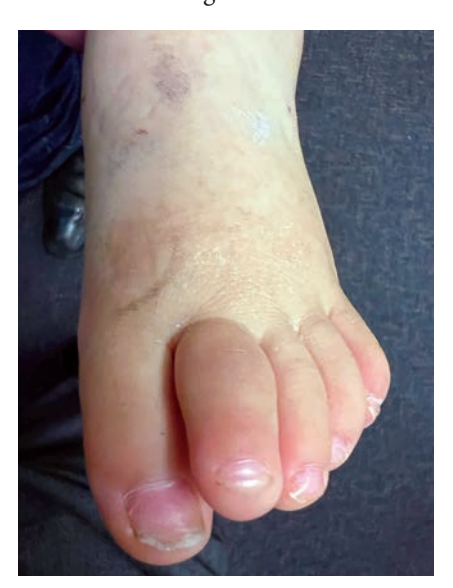
Figure 4. Dactylitis shown here as the uniform swelling of the second toe.

Poststreptococcal reactive arthritis may develop after streptococcal pharyngitis or impetigo. It is more common than rheumatic fever in the Caucasian population, with rheumatic fever being largely confined to Aboriginal and Torres Strait