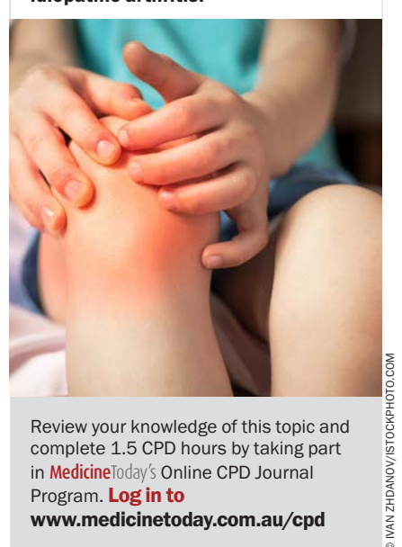
Review your knowledge of this topic and complete 1.5 CPD hours by taking part in MedicineToday's Online CPD Journal Program. Log in to

Describe four extra-articular symptoms of systemic juvenile idiopathic arthritis.