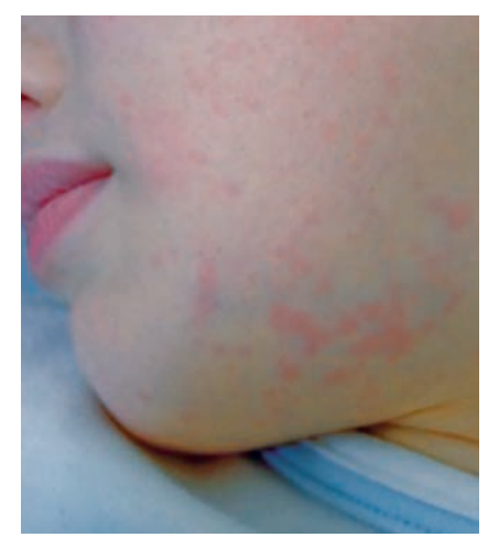
Figure 3. The classic evanescent salmon-pink rash of the systemic onset subtype of juvenile idiopathic arthritis.

A history of a recent viral illness may suggest a postinfectious arthritis, which should resolve within the six-week time frame required for a diagnosis of JIA.