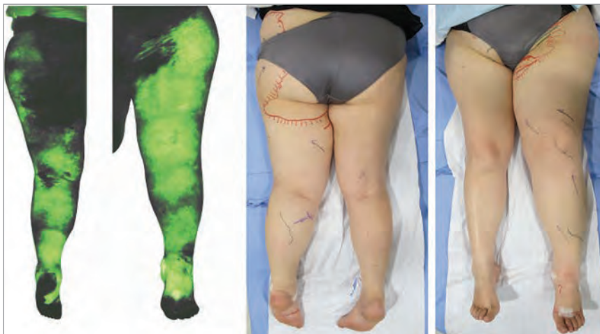
Figure 2. Indocyanine green lymphography of a patient with oedema in the left lower limb. (a, left) The finding of dermal backflow on lymphography is a diagnostic sign of lymphoedema. (b, right) Skin markings made by the technician during the real-time study indicate the direction and course of lymphatic flow, and the extent of lymphatic congestion.