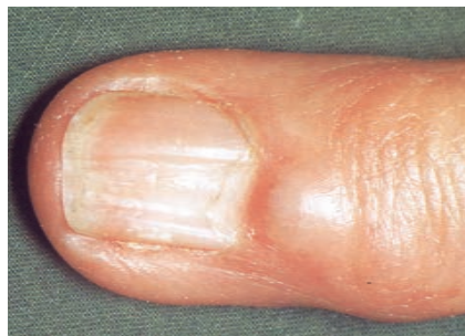
Figure 8. Myxoid pseudocyst at the proximal nail fold with associated longitudinal grooving of the nail plate.

Treatment includes ensuring footwear fits appropriately and maintaining a shorter nail length. Toe taping works to counter the lateral pull exerted by the extensor tendons of the hallux and ameliorate distal nail wall hypertrophy. Podiatrists can assist