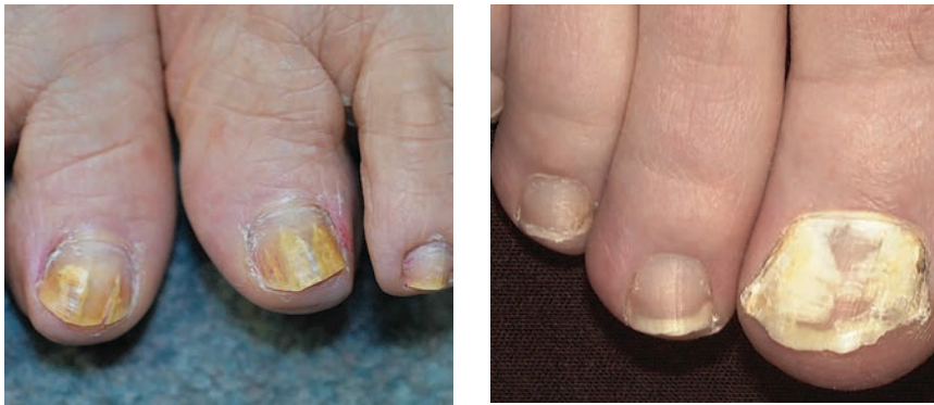
Figures 2a and b. a (left). Distal and lateral subungual onychomycosis. b (right). Superficial white onychomycosis.

effective against onychomycosis. The laser penetrates and heats the nail to destroy the disease-causing organism. However, these treatments are painful and expensive. 7