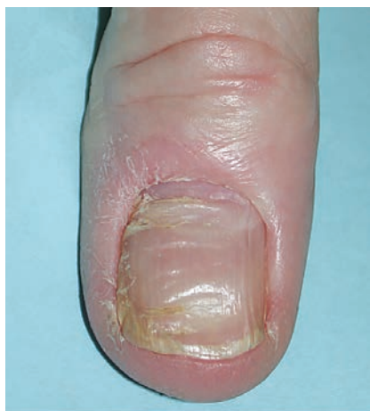
Figure 11. Chronic paronychia.

Patients often present with nail disease in general practice, and these presentations can be acute or chronic. The most common presentations include onychomycosis, psoriasis, trauma and melanonychia. Recognising the key clinical features and management options can prevent treatment