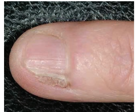
Figure 7. Bowen’s disease with nail dystrophy.

(e.g. cryotherapy, electrocautery, sclerosant injections, intralesional corticosteroid injections or excision of the cyst) or surgery (involving incision and drainage or cyst removal).