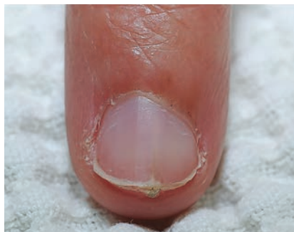
Figures 9a and b. Onychopapilloma with a subungual keratotic mass under the nail plate (a, left) and fissuring of the distal edge (b, right).