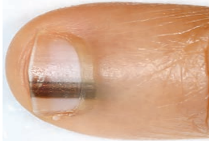
Figure 6. Hutchinson’s sign involving pigmentation of the proximal nail fold.