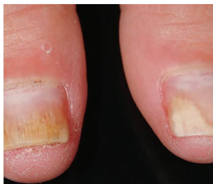
Figures 4a and b. Nail psoriasis before (a, left) and after (b, right) treatment with dexamethasone iontophoresis.

cutaneous psoriasis have additionally demonstrated efficacy in patients with nail psoriasis; as such, future treatment may centre on these emerging therapies. 14 However, these are not currently PBS subsidised for nail disease alone so they are not accessible for patients in the absence of systemic disease.