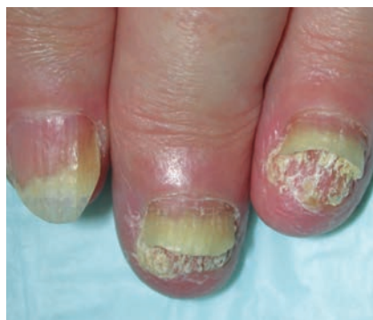
Figure 3. Nail psoriasis with subungual hyperkeratosis, onycholysis, pitting and dystrophy.