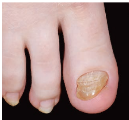
Figure 10. Lateral deviation of the long axis of the nail plate with associated grey/brown discoloration and transverse ridging (oyster-shell deformation).

with burring the thickened nail. Cases of severe or persisting malalignment may need surgery involving rotation of the whole nail unit (nail matrixectomy).