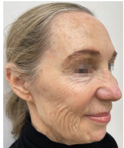
Figures 2a and b. Thin skin and pigmentation with fine wrinkling in a menopausal woman (a, left). More marked wrinkling of the skin on the face in a menopausal woman (b, right).

Images courtesy of the authors. Images obtained with patient consent.