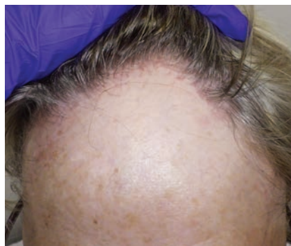
Figure 4. An example of frontal fibrosing alopecia.