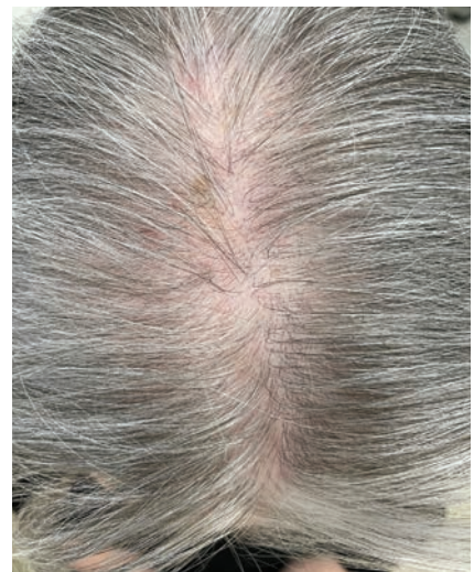
Figure 3. An example of thinning hair in a postmenopausal woman, demonstrating a widened part.

Senile hair fragility occurs with increasing age. Patients should be encouraged to minimise their use of flat irons and other hot hair styling tools, regular hair colouring and hairstyles that twist or tug the shaft. The effects of MHT on senile hair fragility, which has a multifactorial pathophysiology, requires more research.