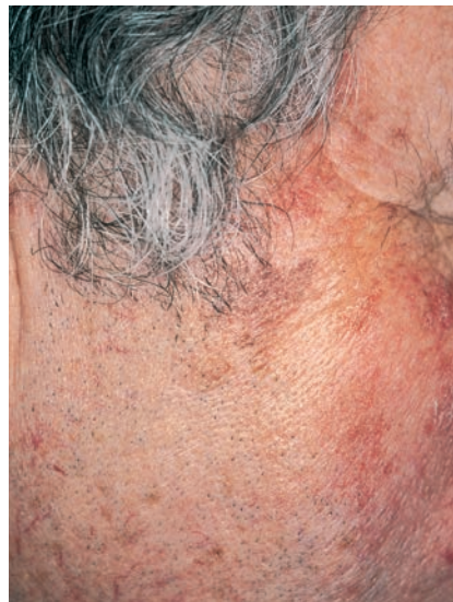
Figure 1. Irregular tan-coloured pigmented macule anterior to the patient's right sideburn.