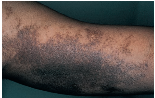
Figure 1. Reticulate and stippled pigmented patch on the patient's left upper arm and shoulder.