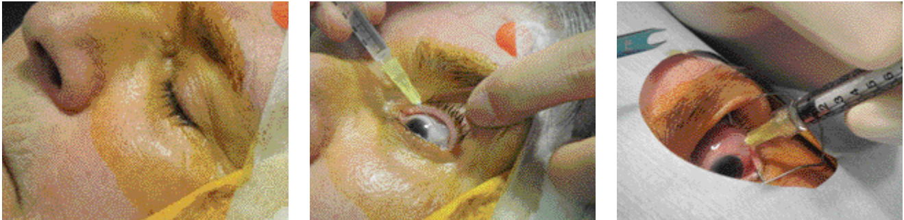
Figures 2a to c. Steps involved in the intravitreal administration of ranibizumab. a (left). After topical anaesthetic, the eye is sterilised with povidone iodine. b (middle). Subconjunctival anaesthetic is applied to the injection site. c (right). Following further sterilisation, the eye is draped and a speculum is inserted to hold the eyelids open. Ranibizumab is injected approximately 3.5 mm behind the limbus.

are the MARINA trial (Minimally Classic/Occult Trial of the Anti-VEGF Antibody Ranibizumab in the Treatment of Neovascular AMD) and ANCHOR trial (Anti-VEGF Antibody for the Treatment of Predominantly Classic Choroidal Neovascularization in AMD). In these trials ranibizumab prevented any further vision loss in three out of four patients with wet AMD over two years, and more than 90% of patients lost less than two Snellen lines of vision. There was an overall