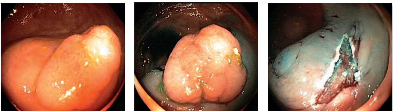
Figures 2a to c. Endoscopic mucosal resection of a sessile colonic polyp. a (left). The polyp before resection. b (centre). The polyp after injection to create a submucosal cushion (blue-coloured area). c (right). After resection.