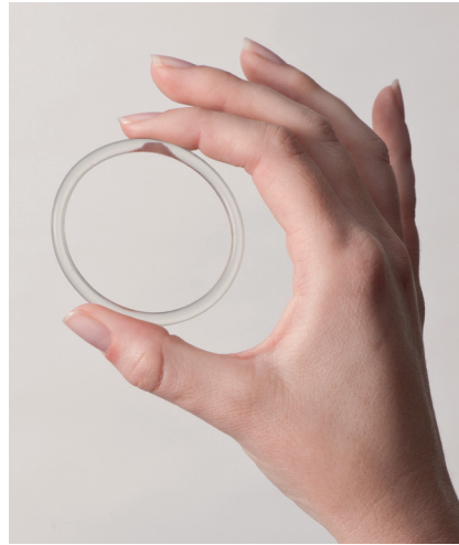
Figure 2. The vaginal ring.