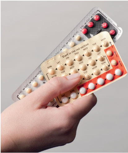
Figure 1. Combined contraceptive pills.