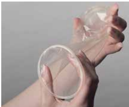
Figure 1. The female condom.

series is based on the publication Contraception: an Australian Clinical Practice Handbook, 3rd ed. , published by the Family Planning Organisations of New South Wales, Queensland and Victoria. 4