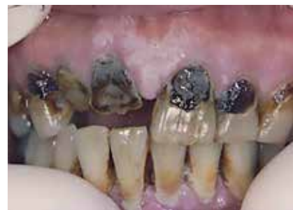
Figure 2. Dental caries exacerbated by severe salivary hypofunction.

An alternative is a sodium bicarbonate rinse, which patients can easily make themselves, consisting of a tablespoon of baking soda dissolved in a litre of water. Patients need to be strongly advised to use this as a rinse only and to spit it out after use to avoid the side effects of ingestion. These include renal impairment and in large doses, metabolic alkalosis, oedema due to sodium overload, hypervolaemic hypernatraemia with hypertension and worsening of congestive heart failure.