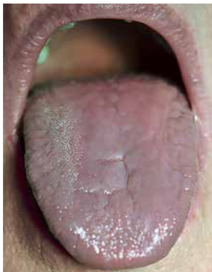
Figure 1. Atrophy of the dorsal tongue caused by salivary hypofunction.