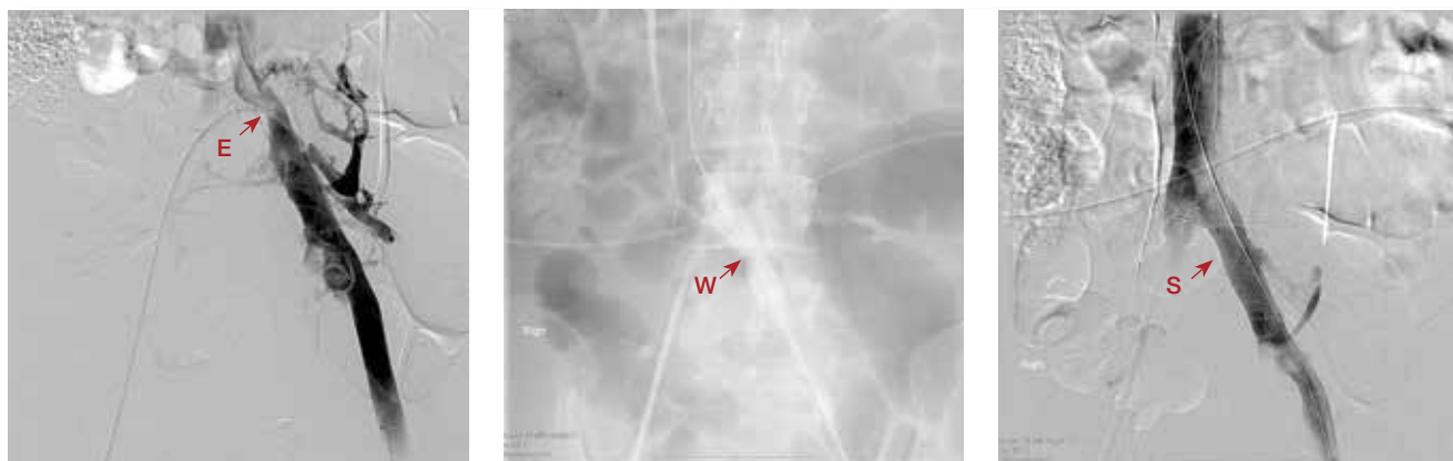
Figures 2a to c. Stent insertion to treat venous stenosis that persisted after thrombolysis in the patient shown in Figure 1. a (left). Venography showed good clearance of the thrombus, but effacement (E) of the left common iliac vein and persistent filling of collateral veins indicated continuing venous stenosis. b (centre). An angioplasty balloon inflated in the left common iliac vein showed waisting (W), indicating the area of venous narrowing. c (right). After deployment of a stent (S), the collateral veins were no longer visible, indicating improved flow through the previously obstructed segment.

amount of the thrombus load, in practice some adjunctive pharmacological thrombolysis is almost always required. In patients who have a contraindication to thrombolysis, such as recent surgery, surgical thrombectomy can be considered.