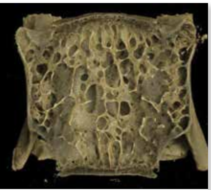
Figures 2a and b. Microcomputed tomography scans of osteoporotic bone.

A number of tools have been developed to predict future fracture risk to underpin and support clinical decision-making, treatment recommendations and risk communication with individual patients. At the Garvan Institute, we have developed the Garvan Fracture Risk Calculator (available at www.garvan.org.au/bone-fracturerisk). This tool uses the individual's sex,